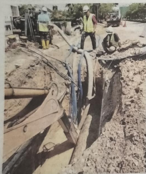
Kerja-kerja pembaikan paip utama di Persiaran Selangor, Seksyen 15 Shah Alam sedang giat dijalankan semalam.